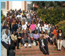
Graduate School Fair