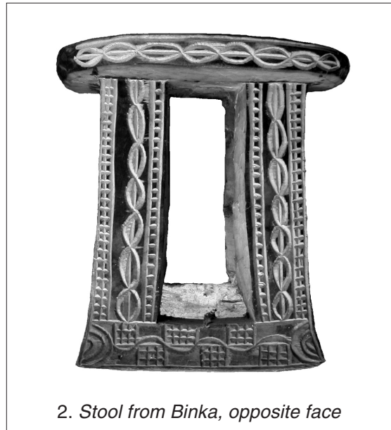
2. Stool from Binka, opposite face